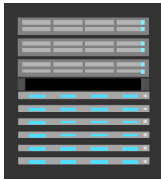
ActiveScale P100 base unit

This document supports the following hardware: