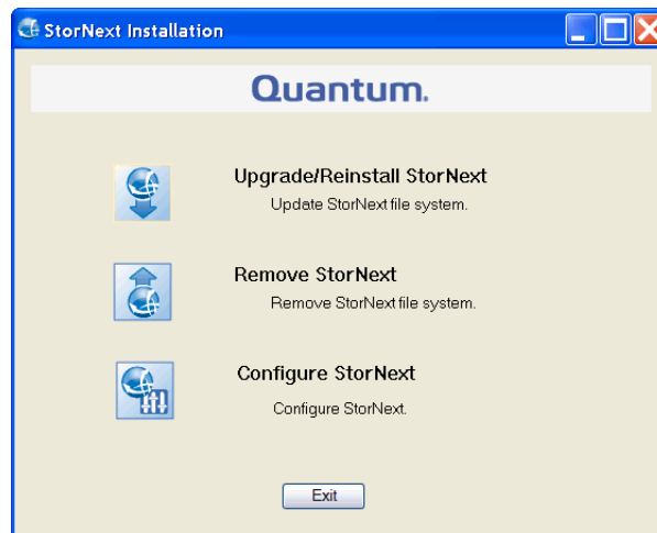
Figure 3 StorNext Installation Window: Upgrade/Reinstall StorNext

The StorNext Installation screen appears ( Figure 3 ).